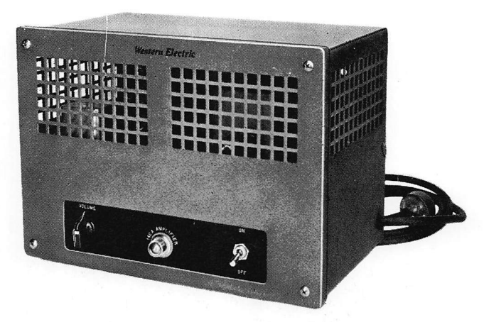
1140A Amplifier. (140A Amplifier in a KS 13678 Cabinet.)

Conforms to protection requirements of the Underwriters Laboratories for equipment installed on subscriber's premises.